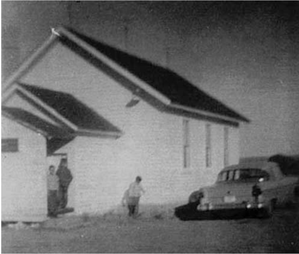
Greenland School house in 1955.

information on this school and other Douglas County schools can be found at douglascountyhistory.org